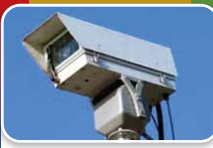
Security cameras: 25 security cameras installed and maintained at entry points and strategic locations. The plan is to expand the camera network.