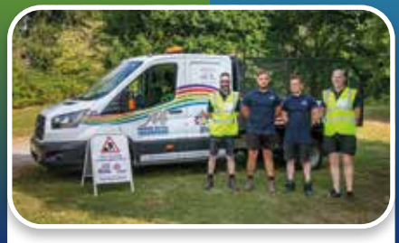
Enhanced Maintenance: A dedicated maintenance team provide over 100 hours of dedicated, additional grounds maintenance each week.