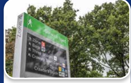
Signage: Over 200 directional and wayfinding signs installed and maintained.