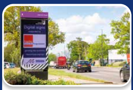
Digital advertising: Four digital advertising screens managed and maintained for cheaper outdoor advertising by Manor Royal companies.