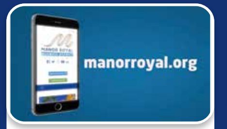
Always Online: Managed website and social media channels.