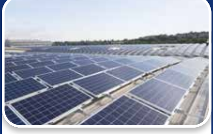
Energy: Funding secured to test the feasibility and set up a Local Energy Community to make it cheaper and easier for companies to work together to generate their own energy.