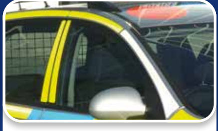
Crime down: Reported crime stands at just over 300 per year, down from a peak of over 400.