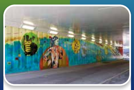
Subways: 2 Subways were upgraded to provide a more inviting entry point for pedestrians and cyclists. They are constantly monitored and maintained by the BID.