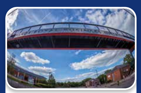
Gateway 1 (Gatwick Road / Hazelwick Flyover): Busiest entranceway to Manor Royal completed in Term 2, with further improvements planned to the roundabout area.