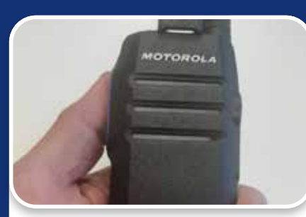
Security radios: Vulnerable retailers have access to free security radios to connect and warn each other of issues and incidents.